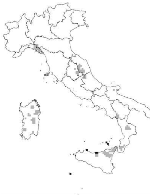
Figure 9. Distribution in Italy of the Habitat 4090: in black the new cells, in grey the cells officially reported in the 4th Habitat report ex-Art. 17 (period 2013–2018; Eionet 2019), in white (black outline) the cell later reported (Gigante et al. 2019a).