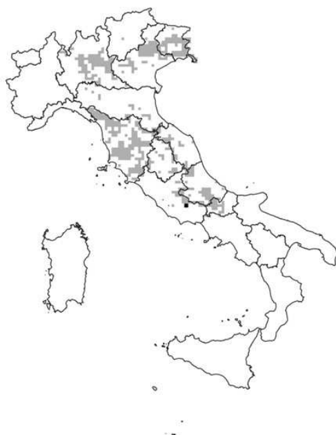
Figure 10. Distribution in Italy of the Habitat 91L0: in black the new cell, in grey the cells officially reported in the 4th Habitat report ex-Art. 17 (period 2013-2018; Eionet 2019).