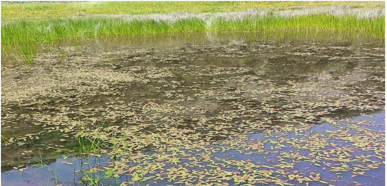
Figure 2. Aspect of the Habitat 3150 in the reported stand (Valsorda, Gualdo Tadino, Perugia, Italy).