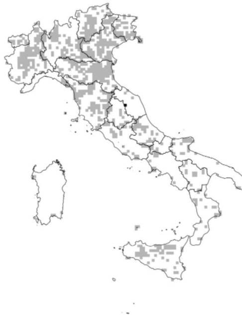
Figure 1. Distribution in Italy of the Habitat 3150: in black the new cell, in grey the cells officially reported in the 4th Habitat report ex-Art. 17 (period 2013–2018; Eionet 2019).