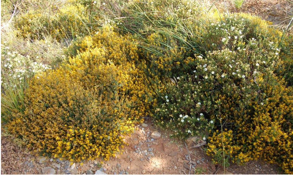
Figure 6. Aspect of the Genista madoniensis vegetation (Collesano, Bosco Pedale).

36.740981 N, 12.020209 E (Tab. 7, Rel. 7); 36.741543 N, 12.022514 E (Tab. 7, Rel. 8); 36.741812 N, 12.023235 E (Tab. 7, Rel. 9); 36.742043 N, 12.024112 E (Tab. 7, Rel. 10); Italy, Sicily, Pantelleria Island, Cuddia Attalora, 36.746551 N, 12.027147 E (Tab. 7, Rel. 11); 36.747172 N, 12.026668 E (Tab. 7, Rel. 12).