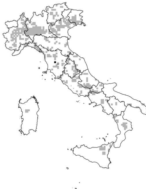
Figure 4. Distribution in Italy of the Habitat 3260: in black the new cell, in grey the cells officially reported in the 4th Habitat report ex-Art. 17 (period 2013–2018; Eionet 2019), in white (black outline) the cells later reported (Rivieccio et al. 2020, 2021).