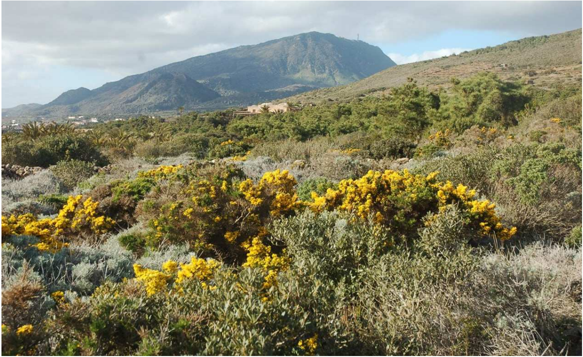
Figure 8. Habitat with Genista aspalathoides (Pantelleria Island).

Natura 2000 Site Code: SAC ITA030030 “Isola di Lipari” [Tab. S2, Rels 1 to 4 in Gianguzzi et al. (2015)]; SAC ITA030029 “Isola di Salina (Stagno di Lingua)” [Tab. S2, Rel. 5 in Gianguzzi et al. (2015)]; SAC ITA020017