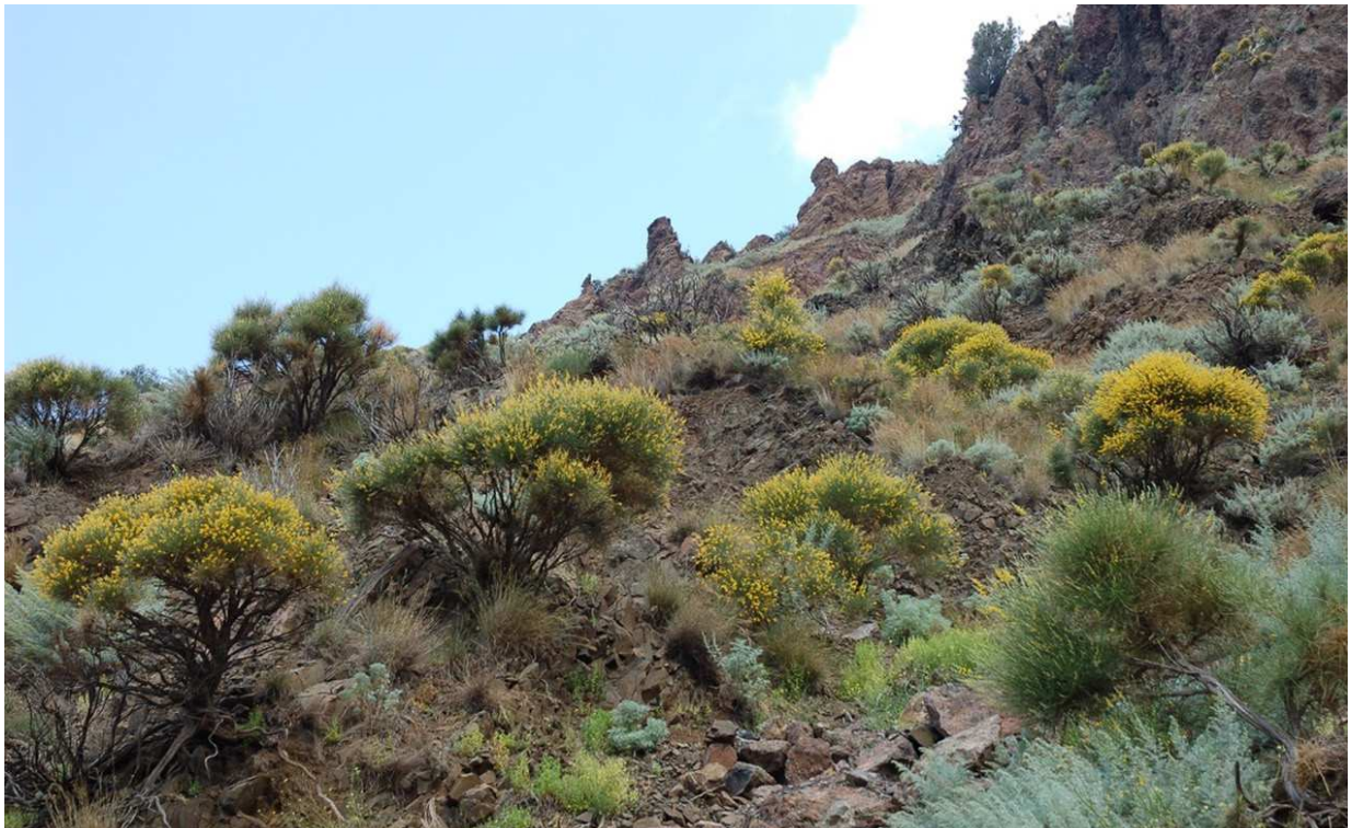
Figure 5. Genistetum tyrrhenae (Lipari Island).