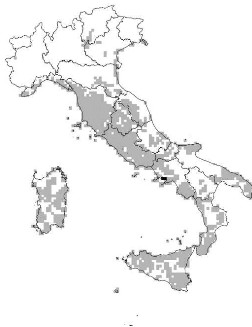
Figure 12. Distribution in Italy of the Habitat 9340: in black the new cells, in grey the cells officially reported in the 4th Habitat report ex-Art. 17 (period 2013-2018; Eionet 2019).