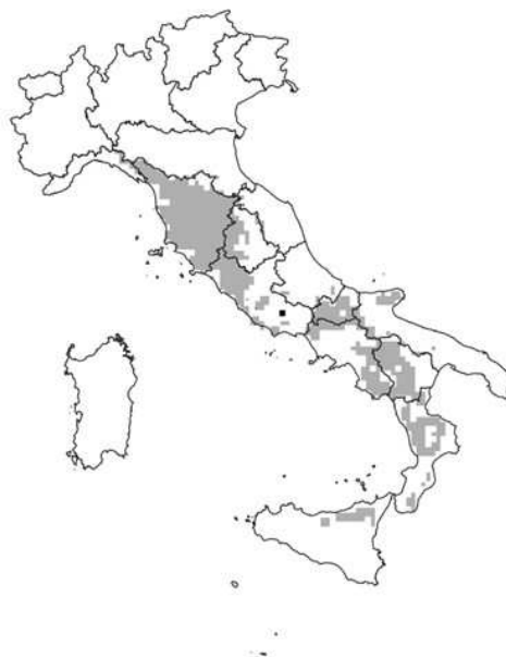
Figure 11. Distribution in Italy of the Habitat 91M0: in black the new cell, in grey the cells officially reported in the 4th Habitat report ex-Art. 17 (period 2013-2018; Eionet 2019).