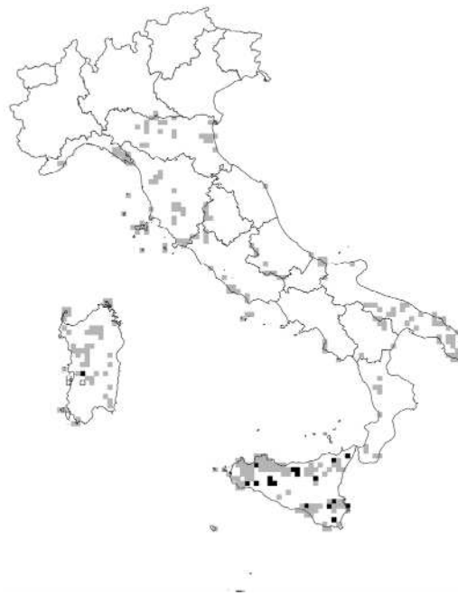
Figure 3. Distribution in Italy of the Habitat 3170*: in black the new cells, in grey the cells officially reported in the 4th Habitat report ex-Art. 17 (period 2013–2018; Eionet 2019), in white (black outline) the cells later reported (Bazan et al. 2021; Gigante et al. 2019a).

Phytosociological table: Tab. 3; taxonomic nomenclature according to “Portale della Flora d’Italia” (2021).