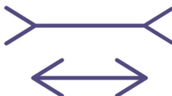
Figure 1. Muller-Lyer illusion

We normally assume that vision does not show any particular variation from one country to another. People living in England see just like the people living in China or Italy. At least, this is what we normally take for granted. Although with no doubt the main properties of vision are universal, it seems that some aspects of vision change with different cultures. To explain this concept, I will use a very famous optical phenomenon, discovered by the German psychologist Franz-Carl Muller-Lyer at the end of the nineteenth century (Judd, 1905). Consider the two lines below. Which of them is longer?