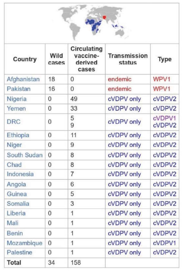
Fig. 2. Polio cases detected worldwide as of August 2024 (data "Global Wild Poliovirus 2017 - 2024". Global Polio Eradication Initiative GPEI, 24 August 2024).

A similar scenario is now being seen in Lebanon, where approximately 346,000 people have been forced to leave their homes due to the ongoing violence stemming from Israeli strikes and attacks. Moreover, the government states that this number could grow to 1 million, with a significant portion of those displaced being women and children. Once again, the humanitarian situation is alarming, as displaced families struggle with inadequate access to basic needs such as food, water, and healthcare. Women and children, in particular, face heightened risks of exploitation and abuse in such chaotic environments [18].