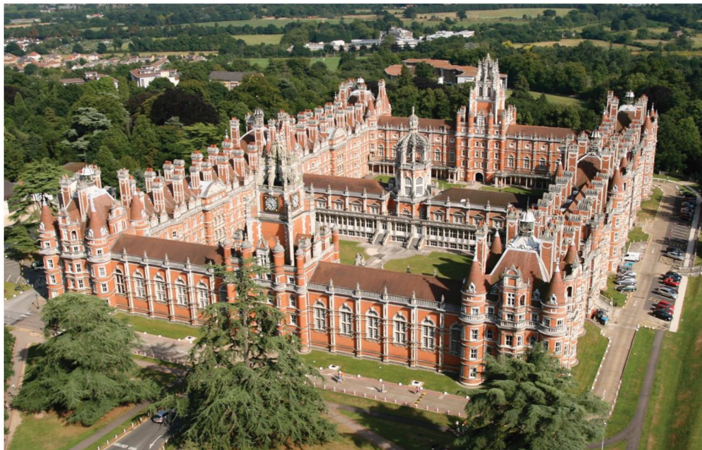
Figure 1. Royal Holloway College: the Founder's Building.

communication within organizations (Boxenbaum et al., 2018; Höllerer et al., 2019). We add to these studies by showing that spatial, aural, sensual and visual modes of the multimodal material object engage with each other, as well as with further verbal and numerical modes, in always different ways: sustaining and opposing each other, evolving or even disappearing, in the craft of rhetorical composition. We show that this engagement can be explained through the features of the messy object.