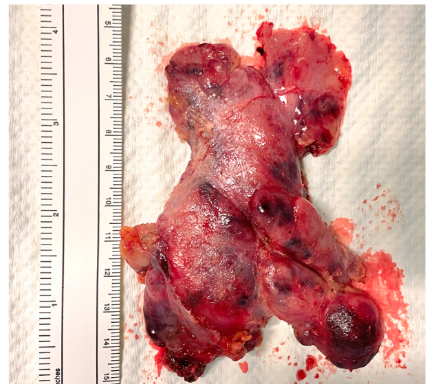
Fig. 3. Macroscopic aspect of thymic gland after surgical resection en block.

transcervical approach in both pediatric and adult patients. Minimally invasive approach to thymectomy, VATS or robotic, has increasingly taken hold in recent years. Compared with open approaches potential benefits of minimally invasive thymectomy include: less of post-operative pain, decreased length of hospital stay, maintaining a very low postoperative mortality, fewer post-surgical functional problems and better aesthetic results [15]. Furthermore any procedure who needs a sternotomy later in life, after a sternotomy for thymectomy would then mean a redo procedure with possible associated complications. In contradistinction, major disadvantage of minimally invasive approach is the greater challenge in completely removing all thymic tissue, especially compromised by technical details difficulty in the approach of the superior and contralateral portions of the gland [16]. Robotic assisted thoracoscopy has demonstrable advantages, including three-dimensional visualization and articulating instruments. They are particularly useful in the dissection of the superior region and in the contralateral (right) side of the thymus. Disadvantage also are present in this technique, such as excessive costs associated with purchasing and