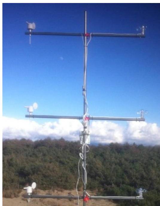
Figure 3. The Environmental Monitoring Node

The system was tested for a period of 24 hours. The sampling rate of the Environmental Monitoring Node was set at one sample each 20 minutes. As previously stated, wind speed and direction was calculated directly on the Arduino Uno Board and then a packet made up of the six data (three speeds and three directions) was sent to the Gateway.