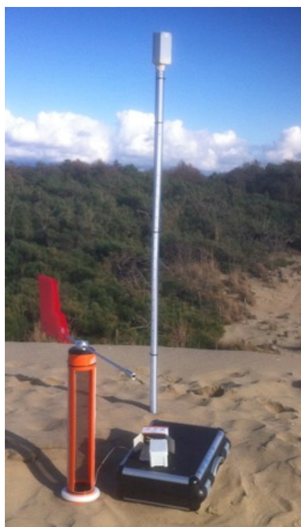
Figure 2. The Sand Collector Node (on the left) and the Sand Level Node (on the right)

The proposed architecture was tested in March, 2016 on the sand dunes located in the San Rossore regional park, Pisa, Italy. For the tests, 5 nodes WSN was set up: this included three Sand Level Nodes , one Sand Collector Node and one Environmental Monitoring Node . The three Sand Level Nodes were arranged in line, perpendicularly to the beach, 10 meters apart from each other. The Sand Collector Node was positioned close to the top Sand Level Node. The Environmental Monitoring Node was positioned on the top of the sand dune 5 meters apart from the top Sand Level Node. The Gateway Node was positioned close to the Environmental Monitoring Node.