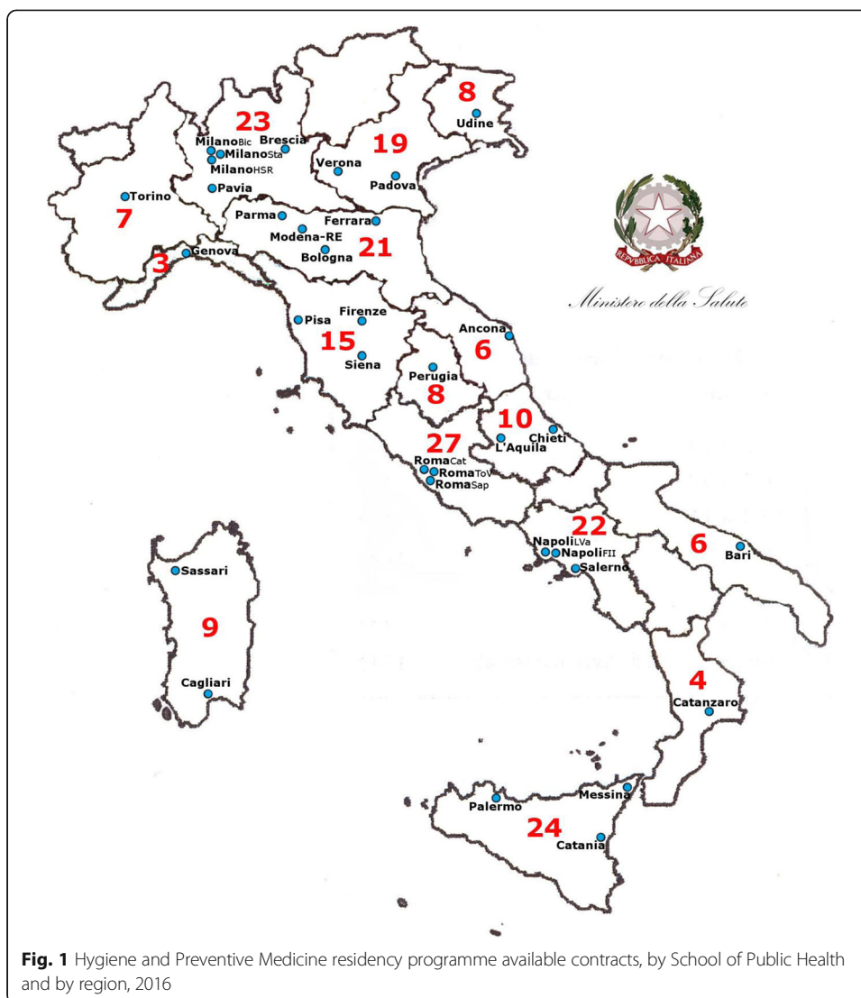
Fig. 1 Hygiene and Preventive Medicine residency programme available contracts, by School of Public Health and by region, 2016

accreditation criteria in terms of structural and organizational standards, professional development requirements, included core competencies, staff and faculty capacity needs.