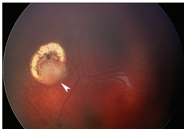
Figure 3: Recurrence of a neonatal retinoblastoma (arrowhead) several months following clinically complete initial regression obtained with infrared diode laser transpupillary thermotherapy

On the other hand, one eye is equally likely to have compromised vision. In New York, mostly before modern