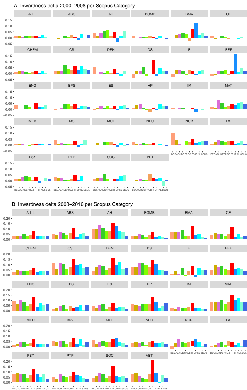
Figure 3: Inwardness delta in Scopus Main Categories in the periods 2000-2008 (A) and 2008-2016 (B). ABS = Agricultural and Biological Sciences, AH = Arts and Humanities, BGMB = Biochemistry, Genetics and Molecular Biology, BMA = Business, Management and Accounting, CE = Chemical Engineering, CHEM = Chemistry, CS = Computer Science, DEN = Dentistry, DS = Decision Sciences, E = Energy, EEF = Economics, Econometrics and Finance, ENG = Engineering, EPS = Earth and Planetary Sciences, ES = Environmental Science, HP = Health Professions, IM = Immunology and Microbiology, MAT = Mathematics, MED = Medicine, MS = Materials Science, MUL = Multidisciplinary, NEU = Neuroscience, NUR = Nursing, PA = Physics and Astronomy, PSY = Psychology, PTP = Pharmacology, Toxicology and Pharmaceutics, SOC = Social Sciences, VET = Veterinary. Source: elaboration from SCIVAL data.