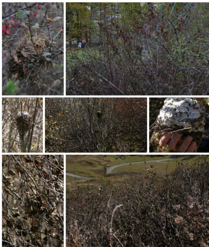
Figure 3 – Nests found in Valsavarenche at 1600 m (up) and in Val di Rhêmes at 1962 m (middle, with Epilobium angustifolium silky fluff) and 2032 m (down).

dimensional space use, and could coexist in the same areas, though the level of syntopy and niche partitioning is yet to be investigated.