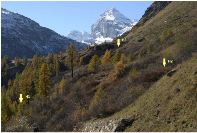
Figure 2 – Location of three hazel dormouse nests found in Val di Rhêmes at 1930 (H1), 1962 (H2), and 2032 m a.s.l. (H3); the area at the limit of the tree line was covered by at least 17 shrub species (see Tab. 2) and scattered larches.