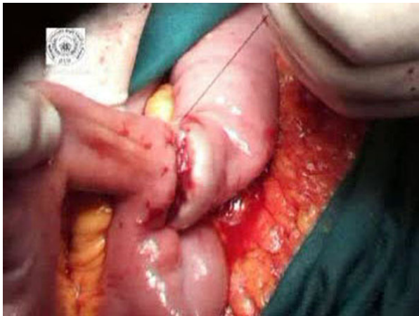
Figure 3 The second purse-string is tied.

conducted according to the ethical standards of the Helsinki declaration. Each patient gave informed written consent.