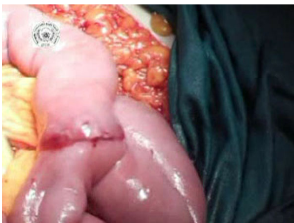
Figure 4 The BAR is snapped forming a serosa-to-serosa inverted sutureless anastomosis.

64 end-to-side Roux-and-Y jejunostomies were performed using a BAR after 57 total gastrectomy and 7 gastric resections. 59 end-to-side Roux-and-Y jejunostomy suture method anastomoses were performed after 57 total gastrectomy and 2 gastric resections for gastric cancer. The mean time spent to complete a BAR anastomosis was 11 \pm 4 min, being the time spent to perform hand sewn anastomosis 23 \pm 7 min ( p=0.030 ). In the BAR group the estimated operative blood loss was lower compared to the suture-method group ( 178 \pm 32 ml and 182 \pm 23 ml respectively), however the difference didn't reach a statistical significance ( p=0.065 ). The postoperative course was uneventful in 75% ( n=44 )