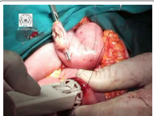
Figure 1 Introduction of 28mm BAR into the proximal jejunum.

the second pursestring is tied (Figures 2 and 3). The BAR is snapped shut by index finger and thumb pressure of two hands, forming a serosa-to-serosa inverted sutureless anastomosis (Figure 4). Before closing the ring the possible rotational error at the anastomosis is corrected. The manually sutured jejunostomy, following the same procedures as described for sutureless anastomosis, is achieved by continuous 3-0 polyglycolic acid multifilament in two layers with inversion technique. Patient demographics, operative procedure, type and location of the anastomosis, overall operating time, intraoperative blood loss, postoperative course and complications, if observed, were recorded for every patient. Postoperative completeness of the BAR anastomosis and fragmentation of the BAR ring were confirmed by abdominal x-ray at 7 th and 30 th day after surgery. The study was approved by the ethics committee of Second University of Naples and