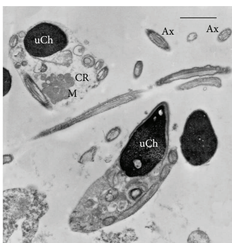
FIGURE 2: TEM micrograph of longitudinal and cross sections of immature sperm characterized by irregular nuclei with uncondensed chromatin (uCh). Cytoplasmic residues (CR) are present embedding swollen mitochondria (M) and coiled disassembled axonemes (Ax). Bar: 1 μm.

from infertile idiopathic patients displayed a weak, dotted staining located in the sperm tail. In infertile patients with varicocele, the label was observed in a high percentage of sperm in cytoplasmic residues, which are abundant around the sperm heads surrounding the coiled tail. Moreover, the signal was clearly detected in the midpiece of the sperm tail. The localization in the sperm tail of 8-iso-PGF 2α in the group of patients with idiopathic infertility and varicocele and the absence in the sperm tail of fertile men seem to suggest the presence of an oxidative damage that could be partially related to the reduced sperm motility. Zerbinati et al. [22] analyzed a group of patients with varicocele showing a reduced number of sperm and motility and observed an altered FA profile compared with the normozoospermic group.