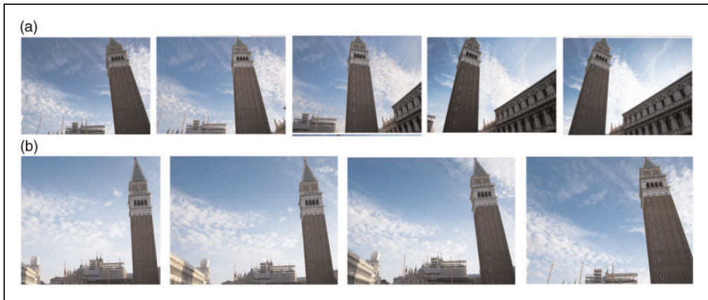
Figure 2. (a) The bell tower of St Mark's Basilica in Venice photographed at different degrees of peripherality by rotating the camera in the horizontal plane. (b) The bell tower of St Mark's Basilica photographed by placing the camera at different distances from it (keeping the tower at the side of the image).

To test the hypothesis about the effect of obliqueness in the LT illusion, we matched three pairs of identical towers for each condition ( peripherality and distance of the camera station point) to obtain six stimulus pairs (see Figure 3(a) and (b)).