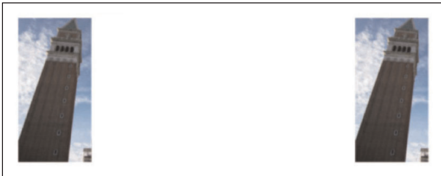
Figure 5. The distance between the towers is too great to group them together, but for some viewers the illusion still occurs.

hand part of the image, while consistent perspective attribution actually reduces the leaning of the Tower located on the left, or at least somewhat reduces its tilt.