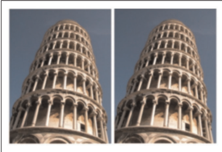
Figure 1. The leaning tower illusion.

they cannot be really parallel but must be diverging as they recede from the viewing point (Kingdom et al., 2007).