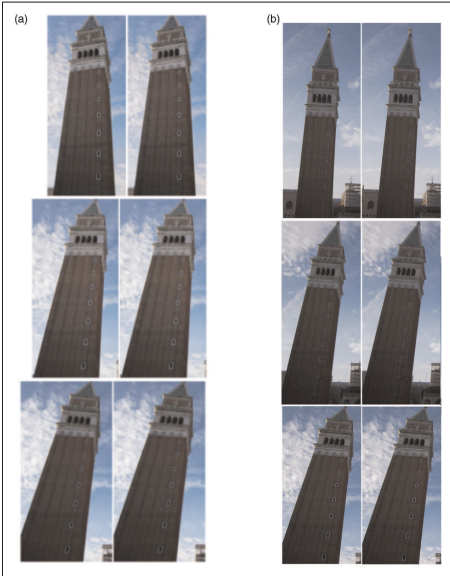
Figure 3. The LT illusion applied to St Mark's bell tower with different degrees of obliqueness: (a) pictures taken at three different degrees of peripherality with respect to the camera station point; and (b) pictures taken at three different distances, that is, varying the slant of the tower, from the camera station point.

from the central point of observation of the double image, the obliqueness is not attributed to the tower, but to the perspective itself (independently of whether the tower is really leaning or not). Instead, when the orientation of the tower and its structural gradient are inconsistent with its perspectival position in the double image, the obliqueness is then better attributed to the tower itself (see Arnheim, 1974; Zanforlin & Vallortigara, 1988). In other words, reconsidering the original version of the LT illusion, we would say that the perspective inconsistency between the foreshortening gradients of the towers and the viewpoint of the observer of the double image increases the leaning of the Tower of Pisa located in the right-