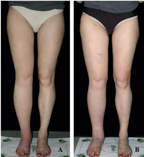
Figure 3. Clinical appearance of right lower limb before (A) and after (B) s-LVA. This patient reported lymphedema of the lower right limb after ovarian cancer surgery; after the s-LVA the limb circumference reduced and no cellulitis were reported in the year after s-LVA.

case damages the lymphatic vessels and may worsen the lymphoedema. Lymph vessels and subcutaneous tissue undergo to cellulitis-induced