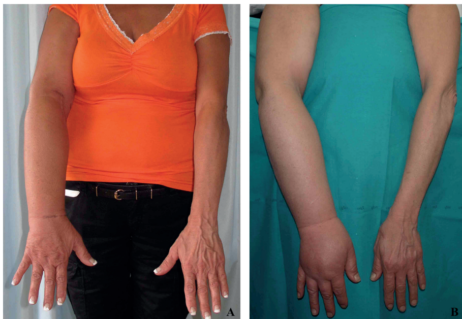
Figure 4. Clinical appearance of an upper limb in a lymphoedema case after the s-LVA (A). Clinical appearance before s-LVA (B). This patient reported lymphedema after breast cancer surgery, with numerous cellulitis; after s-LVA the limb circumference reduced and no cellulitis were reported in the year after s-LVA.

The traditional LVA technique uses lymphatic vessels at the root of the limb, while s-LVA consists in a supramicrosurgical endoluminal anastomosis performed on small veins with 0.2 mm diameter all over the limb; with s-LVA smaller