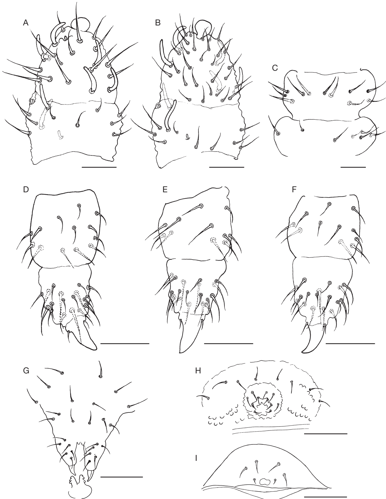
FIG. 2. — Stachorutes najtae n. sp.: A, B , dorsal and ventral chaetotaxy of Ant. III-IV; C , chaetotaxy of Ant. I-II; D-F , chaetotaxy of femora and tibiotarsi of leg I, II and III respectively; G , chaetotaxy of furca and retinaculum; H , male genital opening; I , female genital opening. Scale bars: A-F, 10 \mu m; G-I, 25 \mu m.