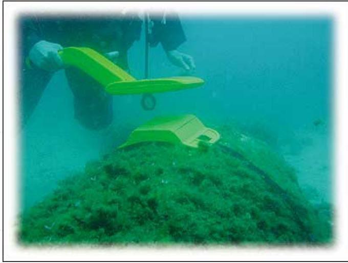
Figure 2. The Enertag system for the pipeline monitoring