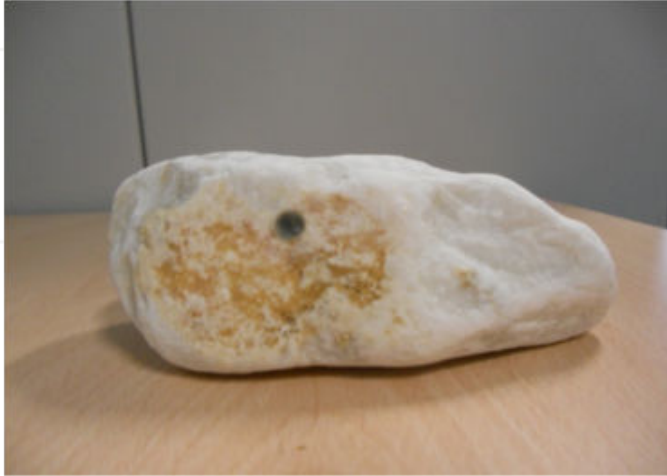
Figure 3. A Smart Pebble. On its surface is possible to notice the hole housing the transponder

The first experimentations on the Smart Pebble system were carried out in 2009 and this solution has been since then employed in several on-site applications on different beaches in Italy. The effective use of the system has roughly confirmed the results recorded in the laboratory tests: during the localization process, the transponders embedded inside the pebbles were localized even from distances higher than 50cm.