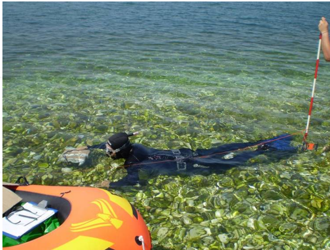
Figure 4. A moment of the localization operations