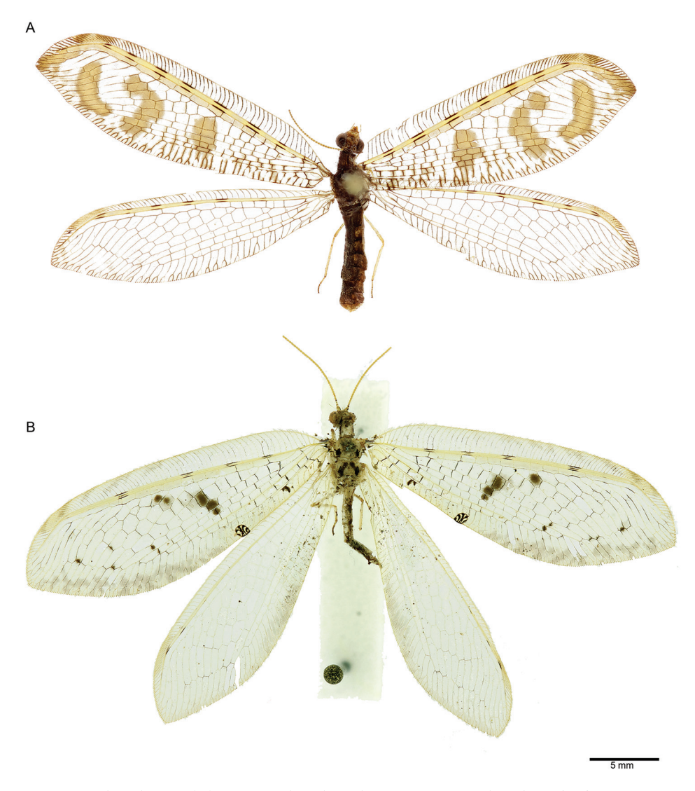
Figure 1. Spilosmylus spp., habitus: A Spilosmylus spilopteryx sp. n. B Spilosmylus tephrodestigma sp. n.

Thorax. Predominantly brown. Pronotum distinctly longer than wide, with undefined paler stripes running longitudinally to it (Fig. 3); mesonotum and metanotum uniformly brown; thorax covered with dark setae. Legs. Pale brown.