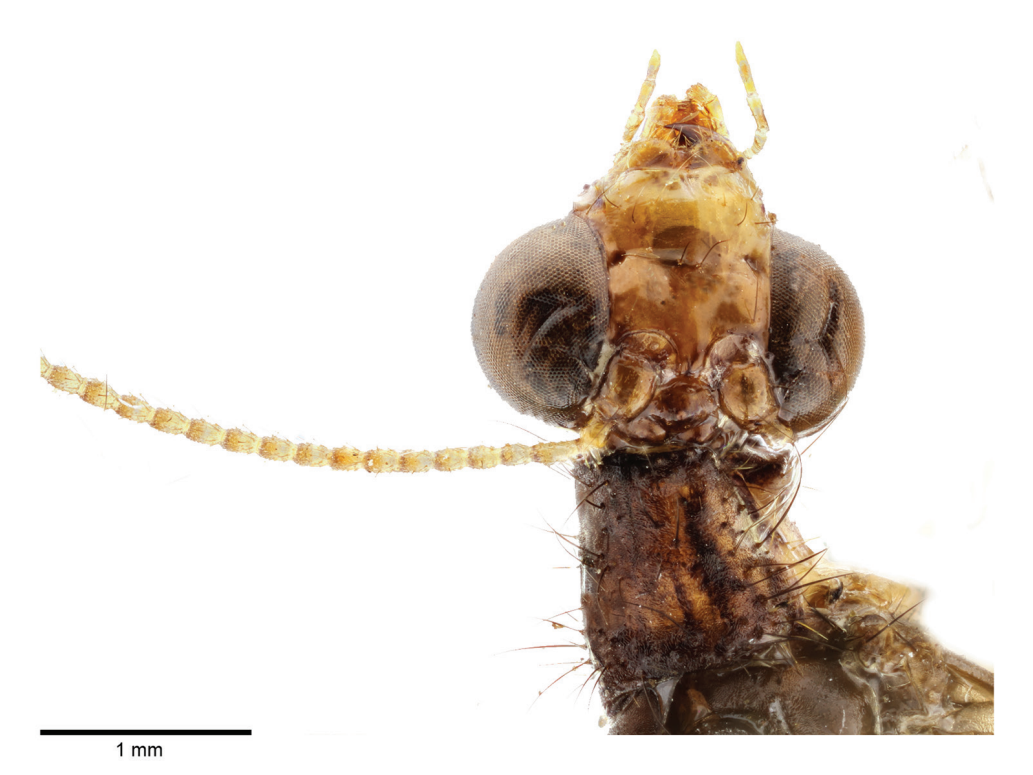
Figure 3. Spilosmylus spilopteryx sp. n. detail of the head and prothorax.

clearly basal to the first branch of Rs. Forewing membrane with a diagnostic pattern composed by: a basal large, oval brown marking present at forewing middle length, a median elongated marking curved outward in proximity of the internal gradates and an apical elongated marking curved inward covering the external gradates (Fig. 2A). The latter marking is slightly more contrasted than the other two marks. MP, CuA, CuP and anal veins shaded with dark brown and with darkened crossveins. The apex of most veins reaching the hind margin is darkened. Embossed spot absent. Hind wing relatively broad. Sc and R yellowish, with intermittent, parallel, black dashes. Subcostal area yellowish like in the forewing but the rest of the membrane is unmarked with the exception of a few slightly shaded veins along the hind margin (Fig. 2A).