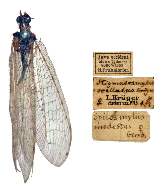
Figure 5. Spilosmylus ocellatus (Krüger, 1914), holotype, habitus and labels (Natural History Museum, Vienna).

appears similar to S. ocellatus (Krüger, 1914) but strongly differing in the shape, extent and contrast of forewing markings. In particular, New (1986a) considered S. ocellatus as an easily recognizable species thanks to its wing pattern, which vaguely resembles the new species in his drawings, although composed by lighter shading and poorly contrasted markings (New 1986a: figs 115–116, New 1991). Nevertheless, the type specimen of S. ocellatus , preserved in the Naturhistoriches Museum Wien (Austria) bears no trace of such intense shading and its wing membrane appears mostly hyaline (Fig. 5). Noteworthy, a hand label of Navás suggest that the latter author also mistook this specimen for the inconspicuously marked S. modestus (Gerstaecker, 1893) (as also noted by Krüger 1914) (Fig. 5). Based on the examination of the type material of Krüger, we consider S. ocellatus and S. spilopteryx sp. n. as two very different taxa only sharing the lack of embossed spot. Further specimens are necessary to assess the identity of the morphospecies attributed by New (1986a) to S. ocellatus .