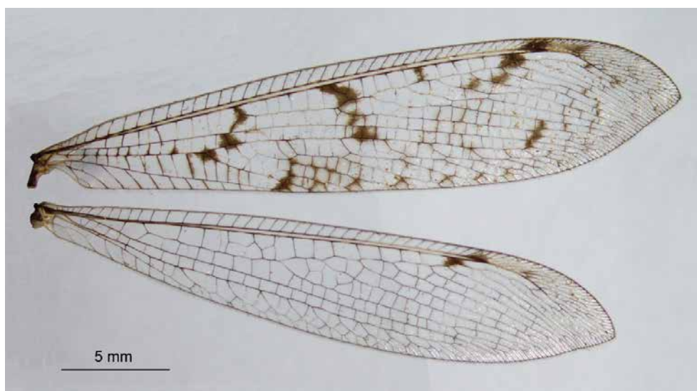
Fig. 2. Wings of Nemoleon poecilopterus (Stein), female.

This species was found in North Macedonia in lowlands up to 700 m a.s.l.