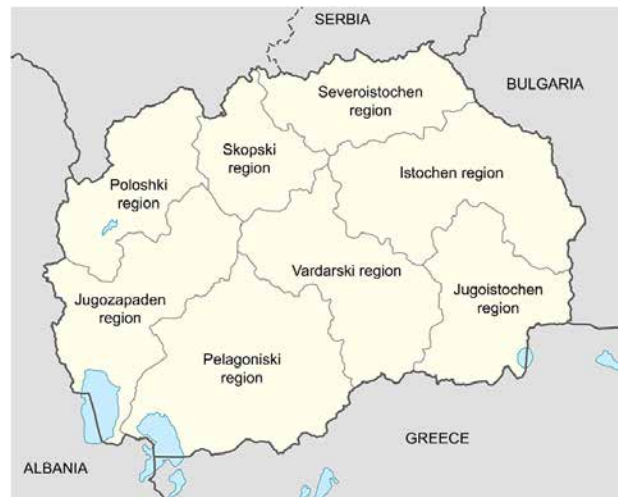
Fig. 1. Map of the Statistical regions in North Macedonia (Map outline credit: MacedonianBoy, CC BY-SA 4.0, via Wikimedia Commons; modified).

North Macedonia is divided into eight administrative units – statistical regions with 80 municipalities (Fig. 1). Collection sites included in the checklist are detailed in Table 1. For each species, a list of localities is given, based on collected material and literature data. The locality-codes include the two-letter abbreviations of the regions and a numerical code (Table 1).