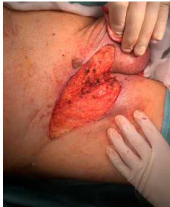
Figure 2. Intra operative picture after acanthoma remotion.