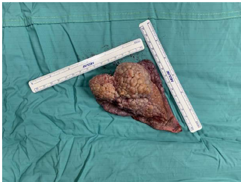
Figure 3. Raised verruciform and mamillated cutaneous neof ormation lesion measuring 12 cm in length, 6 cm in width, and 5 cm in height.