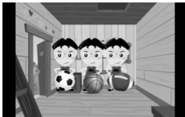
Figure 5: The boys enter the sport tournaments

Here, the surface scope-biasing context (18-a) explicitly mentions that we are interested in finding out whether there is a single individual who joined all tournaments, thereby making salient the question Is there a single individual who entered each tournament? In contrast, the inverse scope context (18-b) (accompanying Figure 5), similar to the contexts used in the present study, puts the emphasis on whether some boy or other joined all the tournaments. It therefore makes salient the question Is it true that for each tournament there is a boy who entered it? If our intuitions are correct, (19) should lead to a yes -answer more frequently when presented in context (18-b). We are currently collecting data on this follow-up.