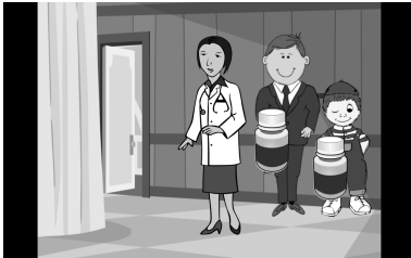
Figure 2: Control item - Each

Target question: Did a waiter greet Lucy?