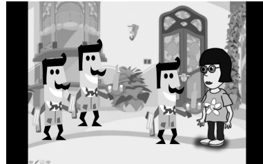
Figure 3: Control item - A

In addition to the targets and controls, four fillers were used to balance the overall number of yes - and no -responses. Like the training items, fillers did not contain any quantifiers. Each of the filler stories could be associated with one of two different questions, one which would elicit a yes -response and one which would elicit a no -response (see (12) for an example). The experimenter selected the appropriate target based on the participant's response to the immediately preceding target item.