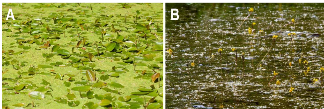
Figure 3. Lemnetum minoris Soó 1927 community with Lemna minor L. and Potamogeton natans L. (A) and Utricularietum australis Müller et Görs 1960 community with Utricularia australis R. Br. (B). Both communities can be referred to the habitat 3150 “Natural eutrophic lakes with Magnopotamion or Hydrocharition -type vegetation” in the study area.

Almost all vegetation types belonging to the Lemnetea and Potamogetonetea classes we report here can be assigned to the habitat Natura 2000 code 3150 “Natural eutrophic lakes with Magnopotamion or Hydrocharition ” (Fig. 3). Though the investigated water bodies are generally small, the assignment of the vegetation types to this