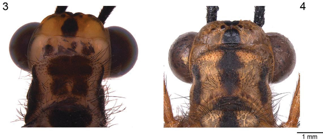
FIGURES 3–4. Pronotum of Megistoleon species. 3. M. ritsemae (Gabon, Ipassa), alcohol preserved specimen. 4. M. thaumatopteryx sp. nov., holotypus, female (Mozambique, Sofala prov.).