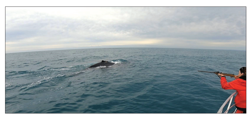
Figure 4: Annual biopsy sampling of humpback whales conducted under the Humpback Whale Sentinel Programme for circumpolar surveillance of the Antarctic sea-ice ecosystem