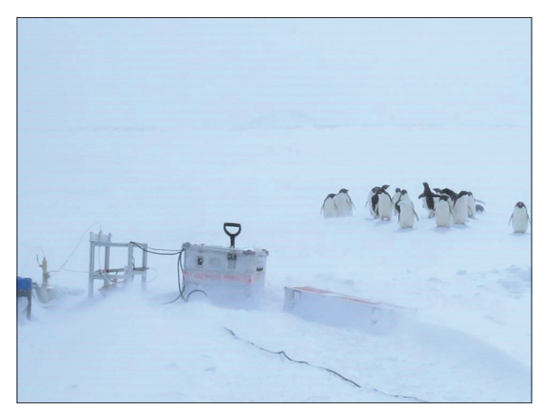
Figure 1: Targeted Antarctic field investigation of chemical redistribution in the coastal seasonal sea-ice zone during spring sea-ice melt