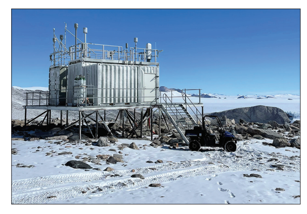
Figure 3: Norway's atmospheric observatory established in Queen Maud Land, Antarctica, in 2008

environmental factors, national political or scientific funding climates, and more recently, the global COVID-19 pandemic. Missed observations in a timeline substantially reduces the power of the dataset to detect change. As such, optimised chemical monitoring efforts should be simple, and, where possible, automated, with low associated logistical and financial costs, raising the feasibility of sustained measurements through societal stochasticity. Furthermore, where possible, these efforts should be integrated with, and ideally led by, national chemical monitoring programmes as ongoing commitments with clear lines of reporting against national and international policy obligations.