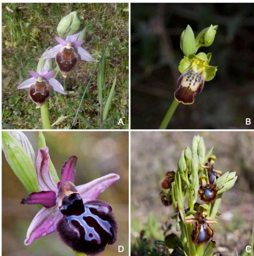
Figure 2. Species not documented by herbarium specimens in Appendix A: (A) Ophrys crabronifera , (B) O. marmorata , (C) O. speculum , (D) O. sipontensis .

For each species the following information is provided: basionym and most relevant synonyms; plant family; life form, attributed on the basis of field observations using the categories of Flora d'Italia [47]; native range; period of introduction (archaeophyte or neophyte); data report in the study area; current invasiveness status for each region, assessed by population monitoring over time according to the terminology of Pyšek et al. [48]; date and discovery localities with details on the location (municipality, administrative province), habitat, altitude, decimal degrees geographic coordinates (datum WGS84); collector(s) ( legit ), author(s) of the identification ( determinavit ) and, eventually, the identity confirmation ( confirmavit ); herbarium where specimen is kept; additional notes. Species not documented with a herbarium specimen are shown in Figure 2.