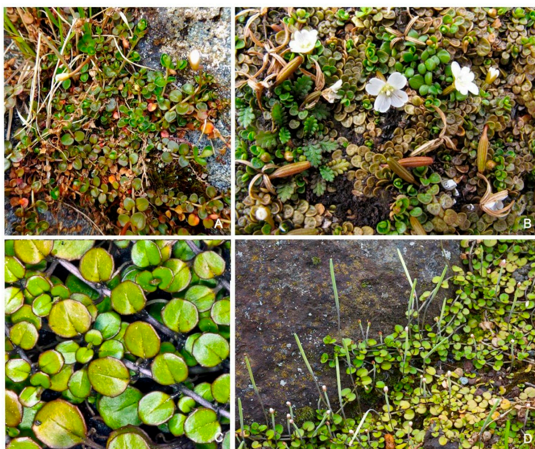
Figure 1. Comparison images of three New Zealand creeping Epilobium species naturalized in Europe/British Isles: (A) Epilobium brunnescens subsp. brunnescens fruiting plant showing growth habit, Mt Te Aroha, North Island, New Zealand, image: P.J. de Lange; (B) E. komarovianum , flowering plant with immature capsules, showing distinctive rugose-impressed leaves, Long Point, Otago, South Island, New Zealand, image: J.W. Barkla; (C) E. nummularifolium , vegetative material showing growth habit, note stem and leaf color and toothed leaf margins; Alghero, Sardegna, image: P. J. de Lange; (D) E. nummularifolium flowering and fruiting plant (note greyish color of capsules); Centre Road, Otago Peninsula, South Island, New Zealand image: D. Lyttle.

Epipactis schubertiorum Bartolo, Pulv. and Robatsch [≡ Epipactis helleborine (L.) Crantz subsp. schubertiorum (Bartolo, Pulv. and Robatsch) Kreutz] Orchidaceae Geophyte rhizomatous Italian endemic First record for Basilicata