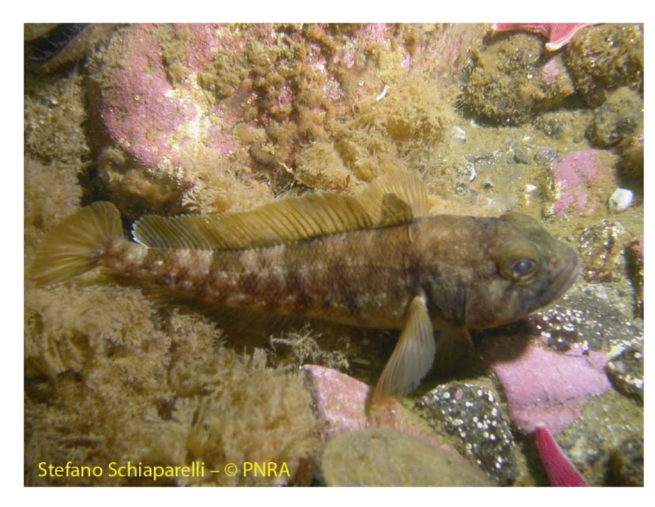
Fig. 3 A specimens of Trematomus bernacchi.

In order to compare with and complement observations in the Arctic, the following discussion focuses on POP temporal trends in marine fish and Adèlie penguins. These species are native to Antarctic marine environment and thus suitable to study temporal changes in contaminant exposure in this region. The Tables 1–4 report the concentrations of POPs in the most studied fish and penguin species. Among POPs, we selected PCBs, p_sp' -DDT, p_sp' -DDE, DDTs, and HCB since other chemicals, including emergent contaminants, were reported only in few articles.