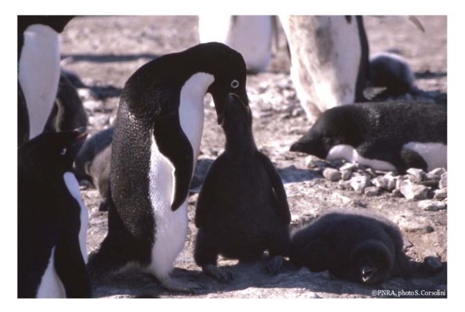
Fig. 2 An Adèlie penguin feeding its chick.

After the calving of the Nansen Ice Shelf (Ross Sea) in 2016, the foraging ground of Adèlie penguins (Fig. 2) changed and penguins fed in this newly accessible sea area. A linkage between food item, ice coverage, foraging range, and POP contamination in Adèlie penguins from a rookery in the Ross Sea (Fig. 1) was already reported in the 1990s. Here, a sequence of events occurred in the 1995/96 summer season: the ice melted completely very early in the season and penguins during the rearing chick period foraged nearer to the shore to save energy instead of swimming offshore for feeding on krill. The penguin diet during the rearing period is based on krill, which