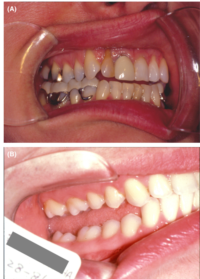
FIGURE 1 Back in the '80s, some practitioners used MORA appliances to manage TMDs (A). Those kind of devices carried the risk for iatrogenic posterior open bite (B)

Two groups involved in these mechanistic approaches deserve some special attention, namely those whose procedures are based on the search for either an ideal neuromuscular-guided position or an ideal condylar-guided position. These are two variants of the prosthodontic concept of an optimal jaw relationship. The adherents to these approaches often base their clinical diagnoses and treatments on the outcomes of using various electronic or mechanical devices such as electromyography (EMG), sonography, jaw tracking, muscle stimulators, condylography, axiography and even postural platforms. Regardless of what the specific TMD diagnosis might be, these protocols inevitably lead to some form of repositioning of the mandible as well as the establishment of a new vertical dimension. As the Figures 1 and 2 show, some amazingly bizarre oral appliances may be provided, and subsequent weird jaw relationships can be produced. In some cases, patients may experience pain relief for non-specific