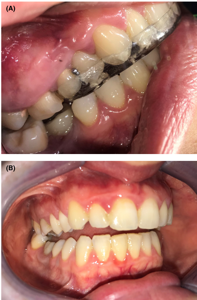
FIGURE 2 More recently, some other practitioners started recommending partial coverage devices (A), which carry the risk for iatrogenic anterior open bite (B)

who think their biologically normal facial asymmetry has to do with their symptoms, or who insist their TMJ click sound must be solved by recapturing the disc at any cost to avoid a future closed lock. Others believe they have problems related with dental occlusion, just because of the purported diagnoses received from previous practitioners, and they are searching for the expert who can finally solve those occlusal problems. Patients who are focussed on their occlusion and use a lot of dental terminology can be very persistent despite a history of treatment failures. They still believe they have to find the right 'specialist' who will be able to finally solve their problems.