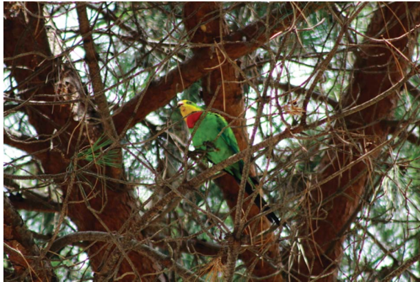
Figure 3. A Barraband's Parakeet in Populonia Station.

( www.ornitho.it ) and Tuscan Regional Atlas ( www.centronitologicotoscano.org ), allow for a wider availability of such data. Among the species we reported in our assessment, the first Italian breeding of Blue-crowned Conure in 2011 in Maccarese, near Rome (P. Bertagnolio, pers. comm. 2011), deserves a special mention. This species has been reported to breed in the United Kingdom and Spain (Table I), but there was no previous evidence of its presence or breeding in Italy. Moreover, the first European sightings of Barraband's Parakeet represent another remarkable result. A specimen in a group of three individuals was photographed by one of the authors (M. Foresta) in Populonia Station and was recognised as an adult male (Figure 3).